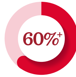
like trying new flavours

At Tyson Foods, we always stay at the forefront of emerging food trends for you. As consumers increasingly seek new flavours that deliver indulgence and joy, Japanese cuisine is emerging as a global icon of modern indulgence and flavour exploration. With its growing influence across international menus, we are bringing the spirit of Japanese-inspired enjoyment to spark your next menu innovation. Your next menu hit starts here.